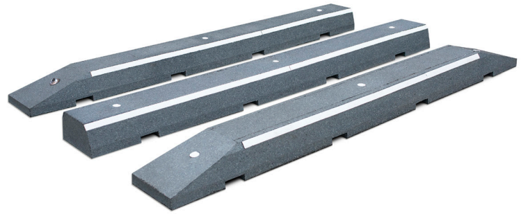
Narrow Cycle Lane Defenders